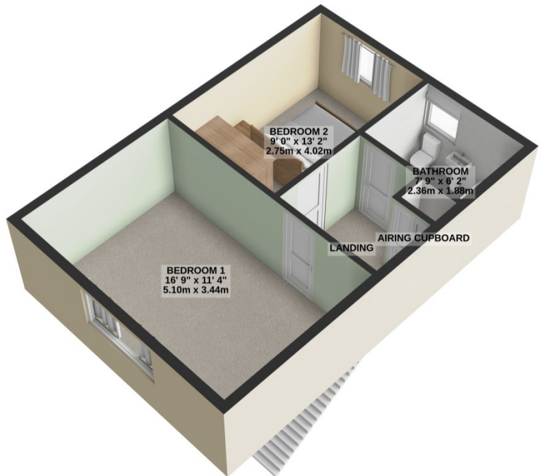
TOTAL FLOOR AREA : 820 sq.ft. (76.2 sq.m.) approx.

For illustrative purposes only. Decorative finishes, fixtures, fittings and furnishings do not represent the current state of the property. Measurements are approximate. Not to scale. Made with Metropix © 2024