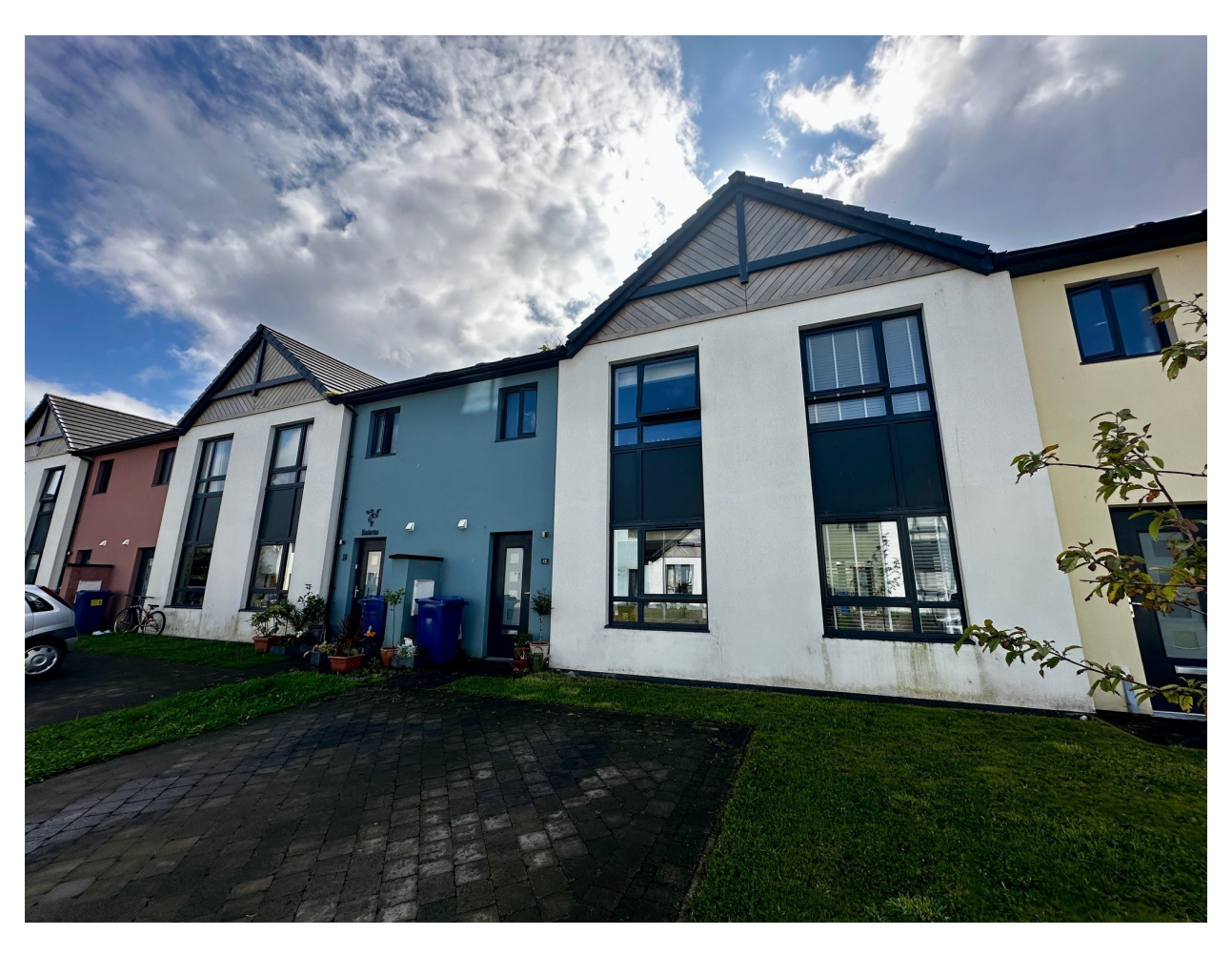
An Immaculate Spacious Modern 3 Double Bedroom Property In A Sought After Location In The Heart of Ramsey Town Centre