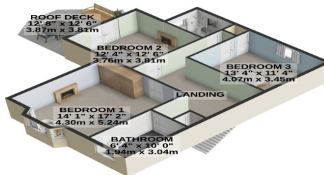
2ND FLOOR 389 sq.ft. (36.2 sq.m.) approx.