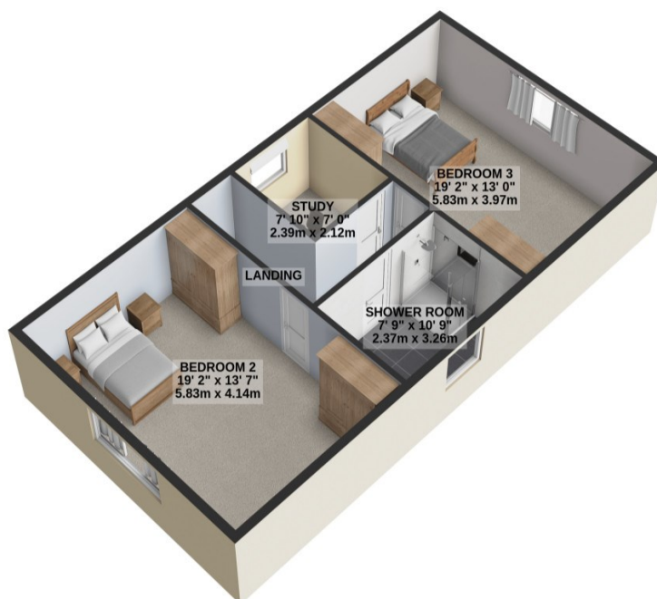
TOTAL FLOOR AREA : 1876 sq.ft. (174.3 sq.m.) approx.

For illustrative purposes only. Decorative finishes, fixtures, fittings and furnishings do not represent the current state of the property. Measurements are approximate. Not to scale. Made with Metropix © 2024