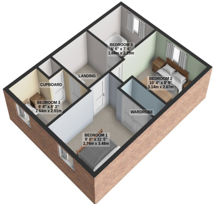
TOTAL FLOOR AREA : 848 sq.ft. (78.7 sq.m.) approx.

For illustrative purposes only. Decorative finishes, fixtures, fittings and furnishings do not represent the current state of the property. Measurements are approximate. Not to scale. Made with Metropix © 2024