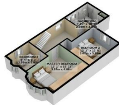
2ND FLOOR 435 sq.ft. (40.4 sq.m.) approx.