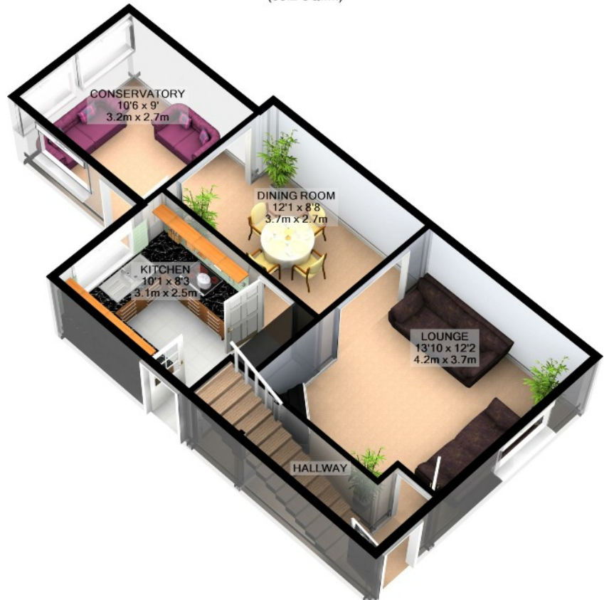
GROUND FLOOR APPROX. FLOOR AREA 497 SQ.FT. (46.2 SQ.M.)

TOTAL APPROX. FLOOR AREA 908 SQ.FT. (84.3 SQ.M.)